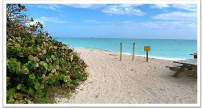
Oceanographic Center is in Dania Beach State Park