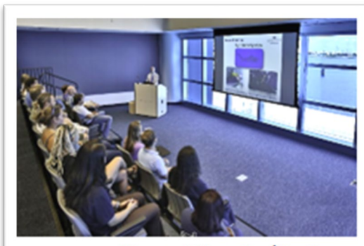
Ocean View Auditorium